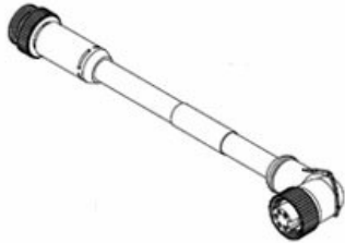
Series image - Reference only

Status: Active Series: 130010 Category: Molex Parts Engineering/Old PN: 115021C01F120